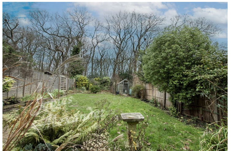
Garden 72'2" x 29'6" (22 x 9)