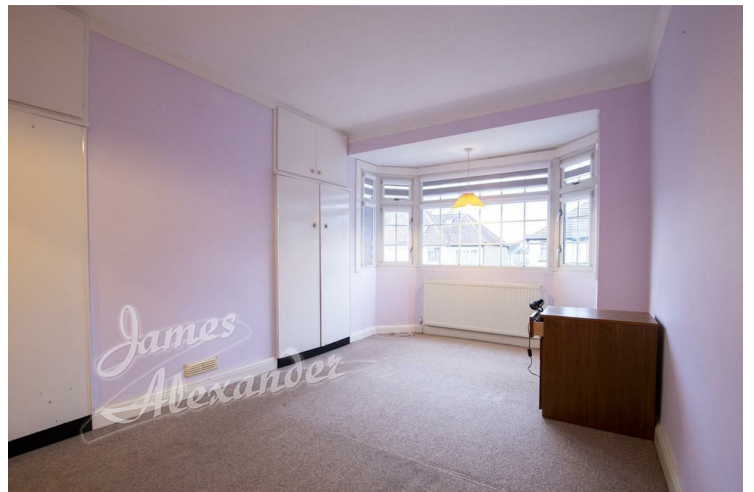
Bedroom 1 15'1" x 11'1" (4.6 x 3.4)